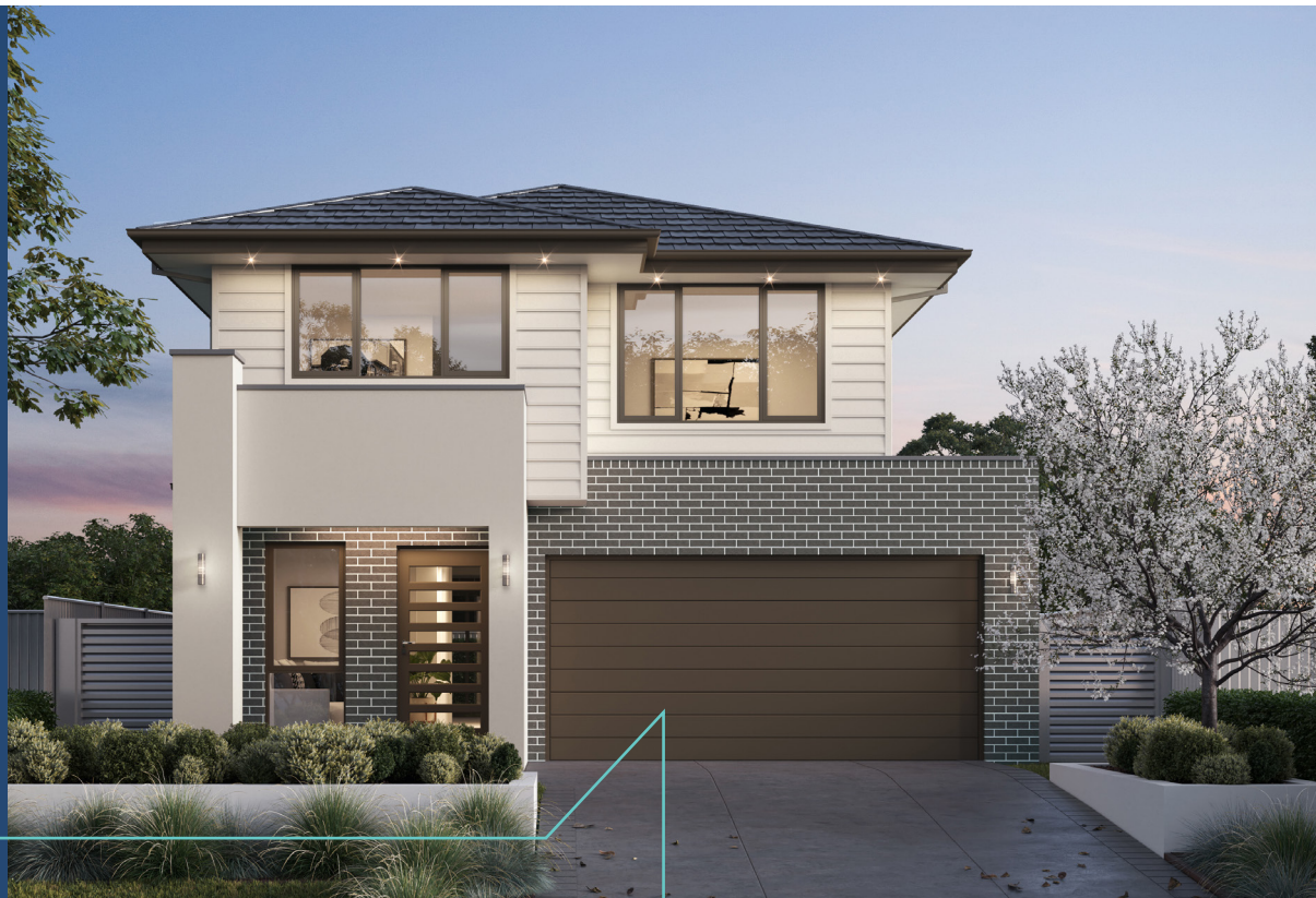
Stellar design Classic facade